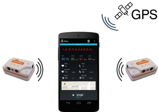
Figure 3. Schematic application setup. The mobile phone receives live data from the two Shimmer sensors via Bluetooth and GPS data for location and speed features. The application (a screenshot of the main interface is visible in the figure) processes the data and displays the information.

The GUI displays the relevant data during training. The raw ECG signal is plotted live using the Androidplot plotting component. Furthermore the current heart rate, the average heart rate and the number of total beats since start were calculated from the ECG signal and displayed in the GUI. The displayed information from the EMG signal are